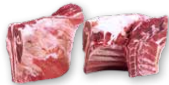
Square Cut Shoulder